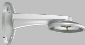
SWB1000 : Wall mount bracket