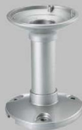
SPB1000 : Pendant mount bracket